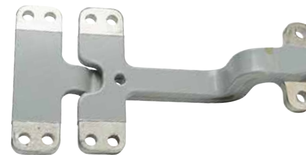
OEMs using epoxy powder insulation can produce more competitive products - achieving a leg up on their competition

Does the manufacturer have the in-house engineering expertise to advise you of the options possible to make these type of applications safe and reliable?