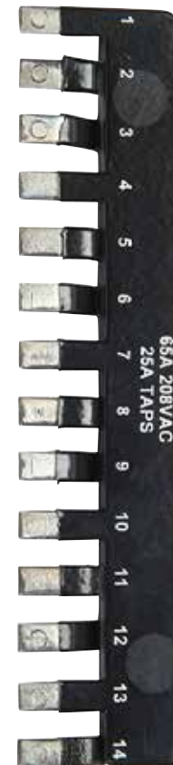
Epoxy powder insulation allows for drastic changes in the design of your medium- and high-voltage switchgear

Choose a provider who can perform a variety of thicknesses. If the provider isn't an expert in the process, you may end up with non-conforming components, holes excessively filled, poor edge conditions, and premature failures.